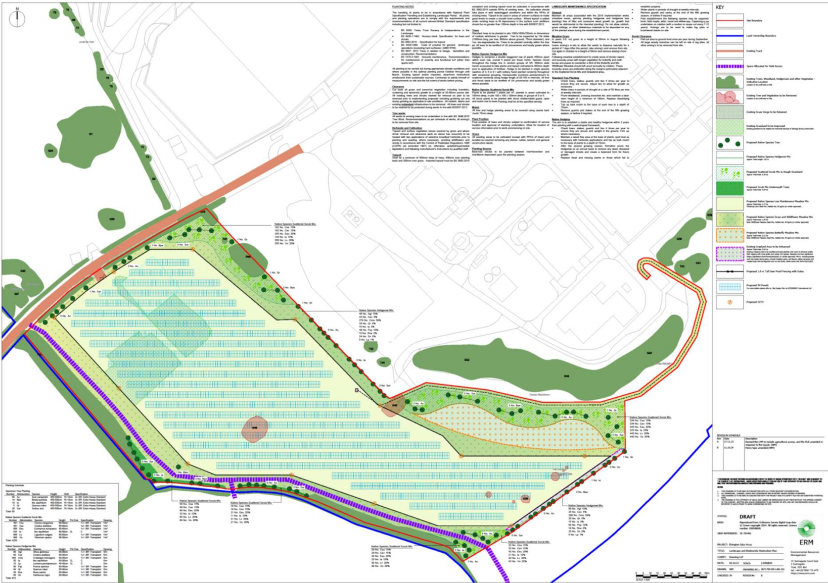
Planning Committee A Meeting - 7 November 2024